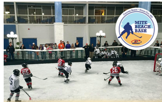
Mite Beach Bash (Ice Hockey) Ocean City