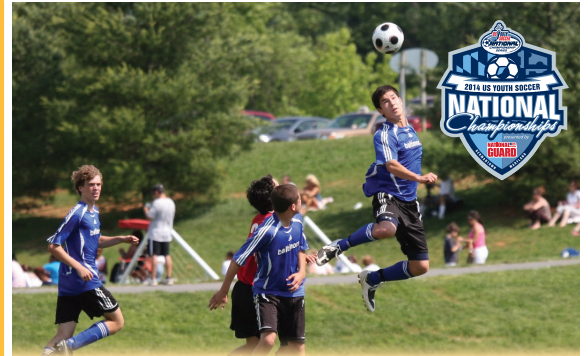
US Youth Soccer National Championship Montgomery County

96 of the top teams in the country 8,000 room nights $4-5 million economic impact