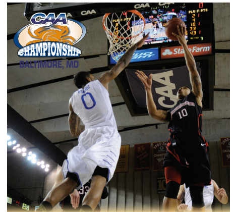
CAA Men's Basketball Tournament Baltimore City - 10 teams | 18,754 in attendance